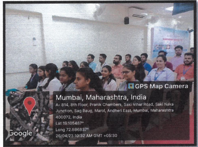
SRBS students while attending the IPR activity

For Sheila Raheja School of Business Management & Research