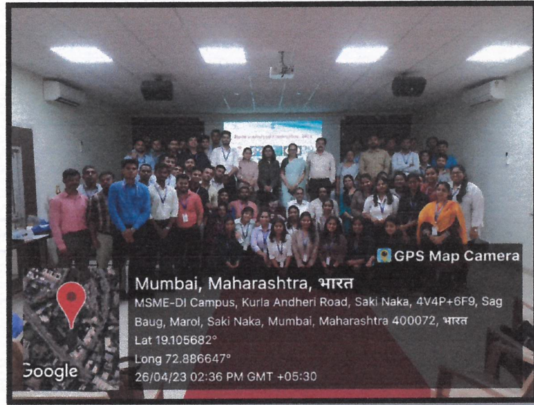
SRBS students with industry expert for IPR seminar