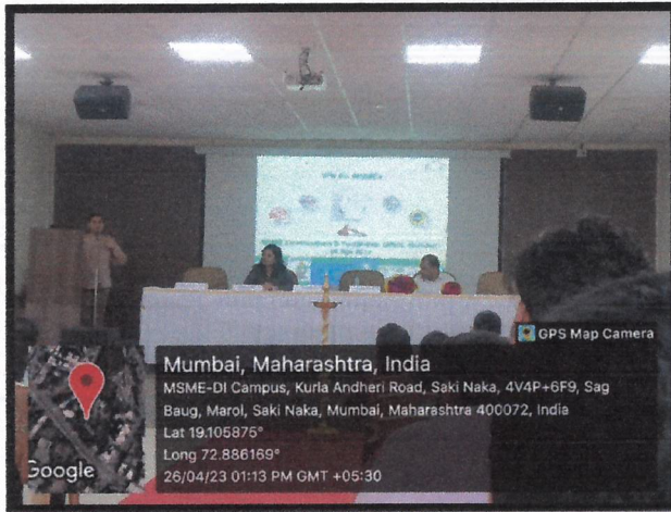
Session on – IPR